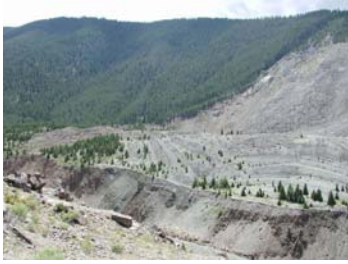
1959 site of West Yellowstone Earthquake. Measured 7.8 on scale