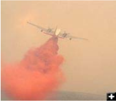
A plane drops retardant on the fire as it moves closer to homes between Fremont Lake and the town of Pinedale July 2007.